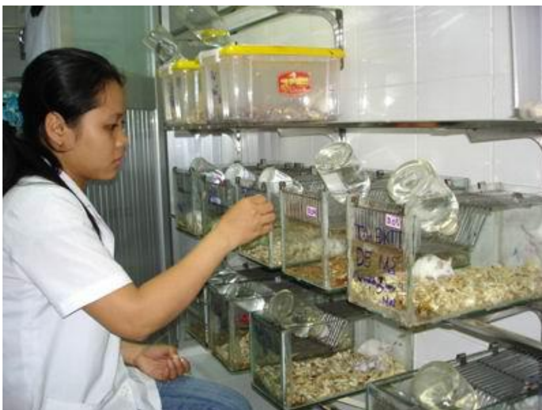
Figure 1. (In this case, the image needs to be enlarged)