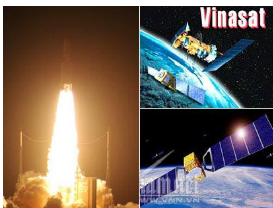
Figure 2. (The case of multiple images)